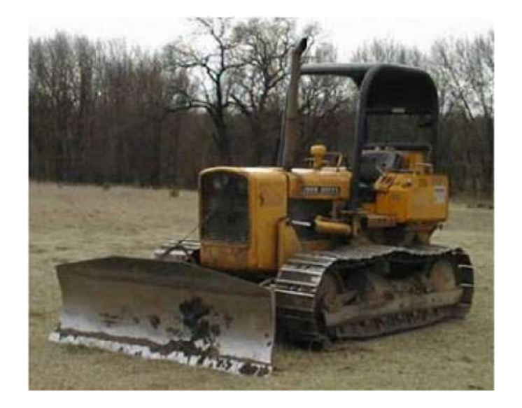
Figure 3: BULLDOZER