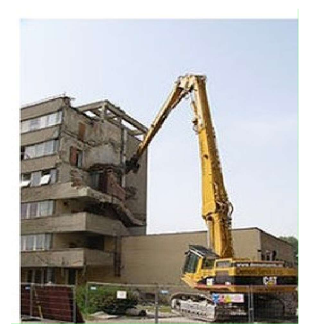
Figure 4: HIGH REACH EXCAVATORS

High reach demolition excavators are more often used for tall buildings where explosive demolition is not appropriate or not possible. These excavators are used to demolish up to a height of 300 feet.