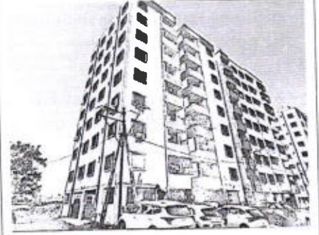
PHOTO OF THE PROPERTY

Property Details: EMT of Residential Flat No. 604 having built up area 52.96 Sq. Mtrs. situated on the Sixth Floor, WING-L4, CERAMIC CITY ,apartment standing on Plot No. 68, 69 and 70, totally admeasuring 1104.67 Sq Mtrs of Non – Agriculture land , Revenue Survey No. 47 , situated at Village- Trajpar of Morbi Taluka of Morbi District of Gujarat.