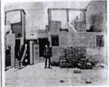
PHOTO OF THE PROPERTY

E-Auction Website: https://www.indianbankseuction.com