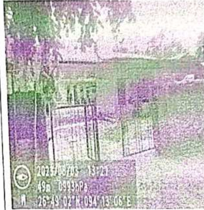
PHOTO OF THE PROPERTY

E-Auction Website: www.bankeauctionwizard.com