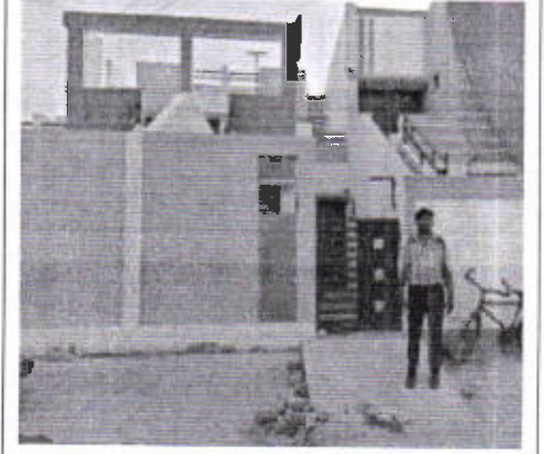
PHOTO OF THE PROPERTY

E-Auction Website: https://canarabank.auctiontiger.net