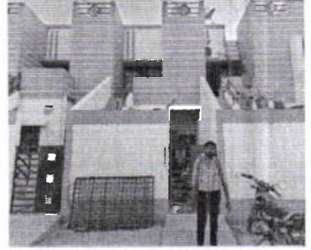
PHOTO OF THE PROPERTY

E-Auction Website: https://canarabank.auctiontiger.net