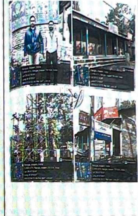
PHOTO OF THE PROPERTY

E-Auction Website: www.bankeaucionwizard.com