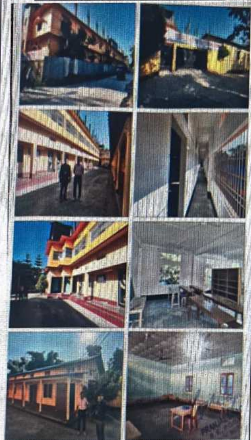
PHOTO OF THE PROPERTY

E-Auction Website: https://indianbankseuction.com