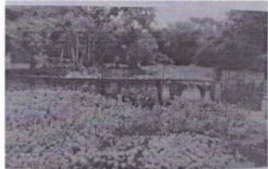
PHOTO OF THE PROPERTY

E-Auction Website: https://indianbankseauction.com .