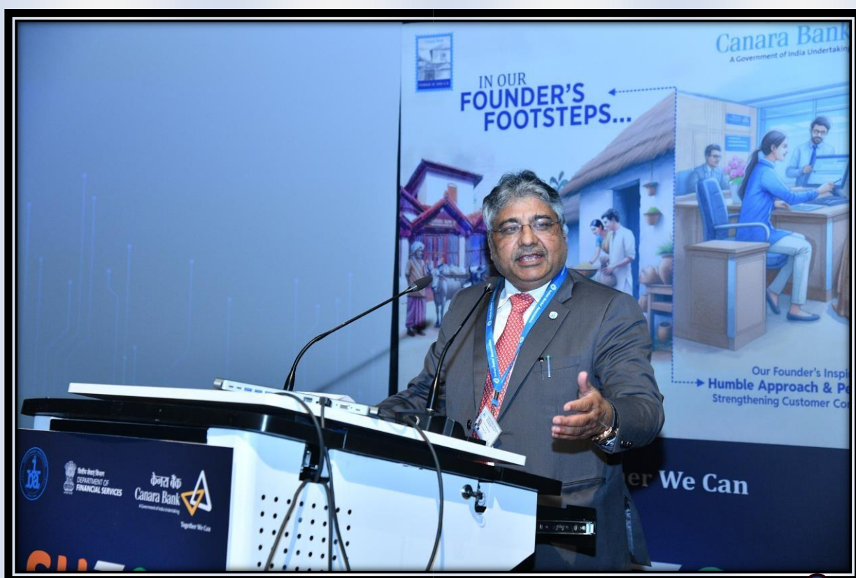
Address by Chief Executive, IBA